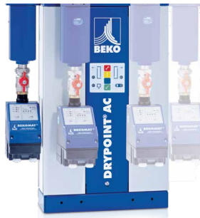
Can be installed on the side and front